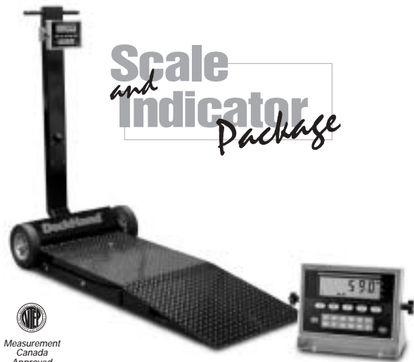
Shown with optional ramp.