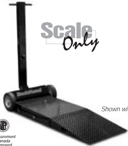
Shown with optional ramp.